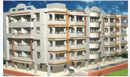
LEKHRAJ PARISAR Rd. No.-3, East Patel Nagar, Patna