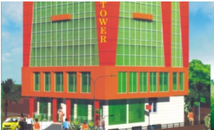
SAM TOWER Bank More, Dhanbad (Jharkhand)