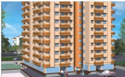
RAMSHAKHI TOWER Tupudana, Ranchi (Jharkhand)