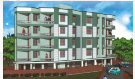
SHIVJISHNU ENCLAVE Anand Puri, Boring Road, Patna