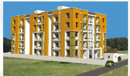
MANSAROVAR ENCLAVE ....., Patna

design & print : adzone # 8877111190, 8877788802, info@adzonegraphics.com