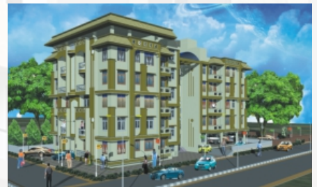
DINESH ENCLAVE West Anandpuri, Boring Road, Patna