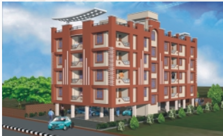
ABHILASHA APARTMENT Road No.-10, East Patel Nagar, Patna