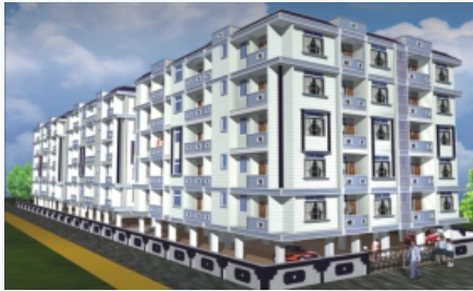
MANJU VATIKA Gola Road, Bailey Road, Patna