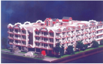
SHIVANIL APARTMENT Kasturba Path, North S.K. Puri, Boring Road, Patna