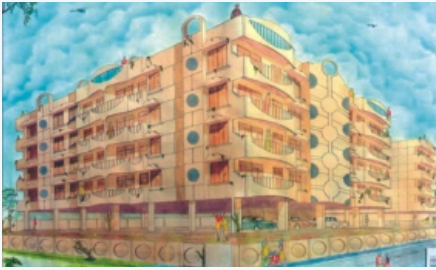
SATYAM APARTMENT Montessori School Lane, Boring Road, Patna