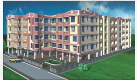
BHUBANESHWARI RESIDENCY Pandit Clinic Road, Bartand, Dhanbad (Jharkhand)