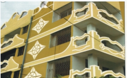
KAPIL SHREE Montessori School Lane, Boring Road, Patna